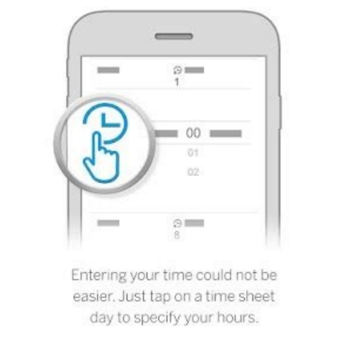
Sap fieldglass timesheet entry. Fieldglass hours.